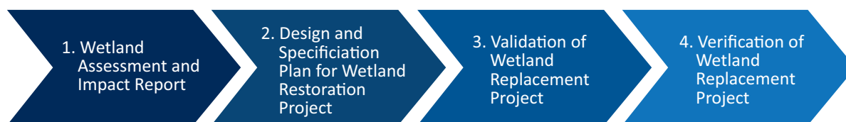
Figure 2. Authentication Points Submissions under the Alberta Wetland Policy

Figure 2 provides a representation of the authentication points under the Alberta Wetland Policy.